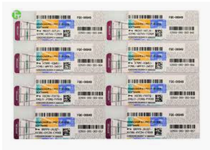
English Windows 8.1 Product Key Sticker ... softwaresoem.com