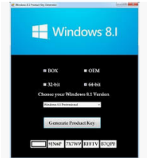
Windows 8.1 Product Key Gene... activationkeys.org